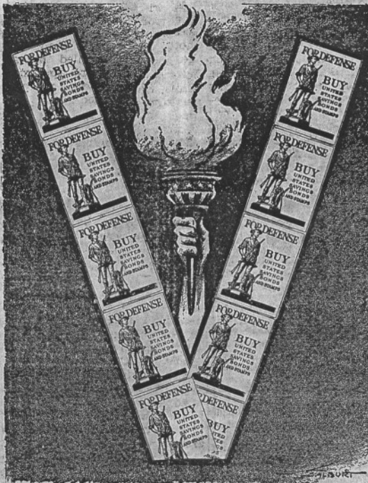
Talbot cartoon courtesy of Washington News.